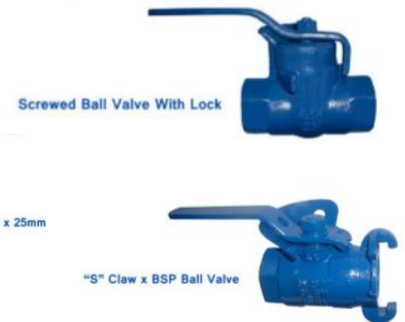
Screwed Ball Valve With Lock