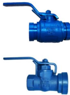
50mm Shouldered x 25mm Ball Valve